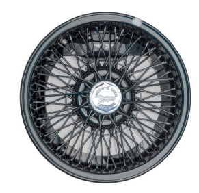
15" Dark Grey Painted Wire Wheels