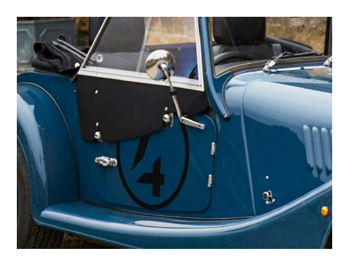
Decal Kit 5 - Door Roundel Matte Black with Number 0-9