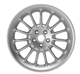
19" Plus Six Alloy Wheels - Silver