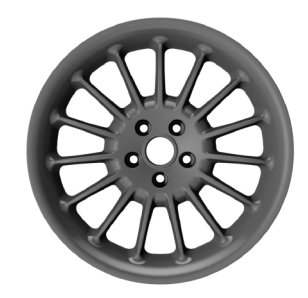
19" Plus Six Alloy Wheels - Frozen Grey<sup>(1)</sup>