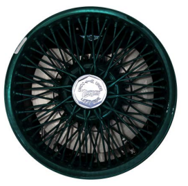
15" Dark Green Painted Wire Wheels