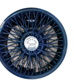
15" Dark Blue Painted Wire Wheels