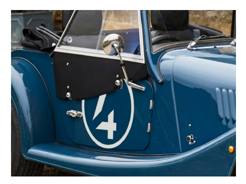
Decal Kit 4 - Door Roundel Gloss Off White with Number 0-9