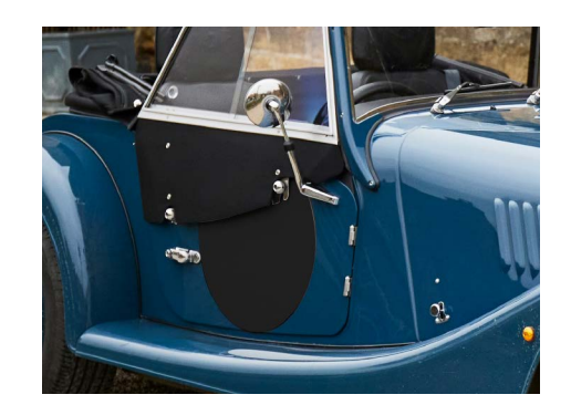
Decal Kit 2 - Door Roundel Gloss, Black