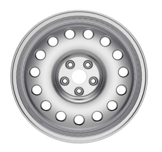
18" Speedster Alloy Wheels - Silver