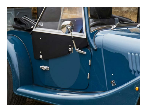
Decal Kit 3 - Door Roundel Matte, Clear