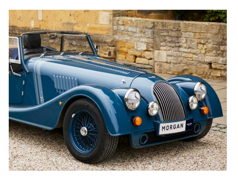
Decal Kit 7 - Matte Stripe Pack