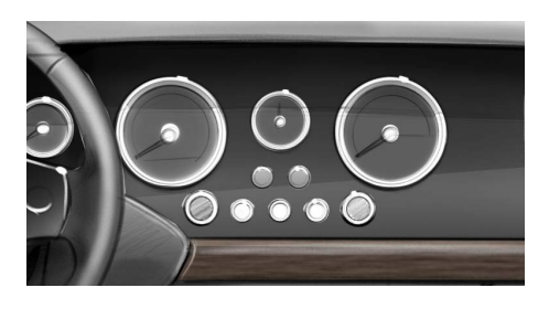
Dashboard - Matte Black Painted