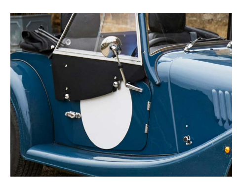
Decal Kit 1 - Door Roundel Gloss, Off White