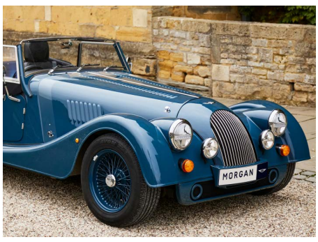
Decal Kit 10 - Bonnet Stripe Matte Clear