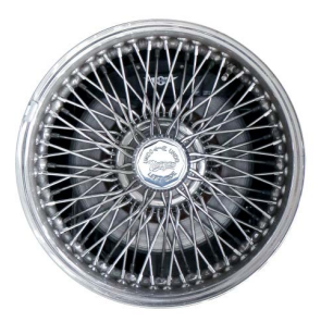
16" Polished Wire Wheels