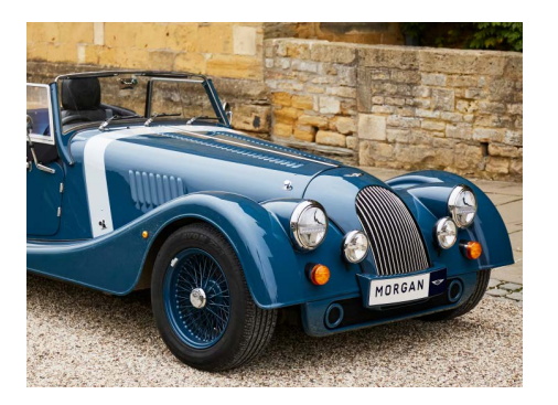
Decal Kit 8 - Bonnet Stripe Gloss Off White