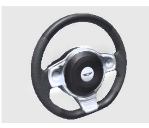
Steering Wheel Centre - Silver