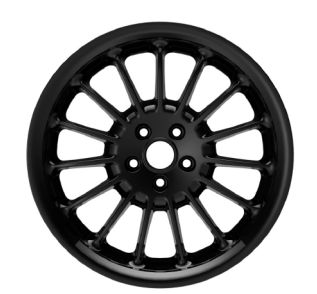
19" Plus Six Alloy Wheels - Black