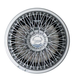
15" Silver Painted Wire Wheels