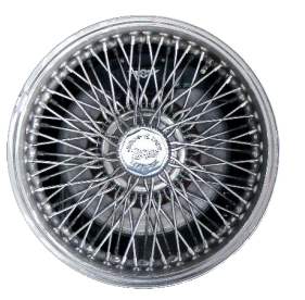
15" Polished Wire Wheels