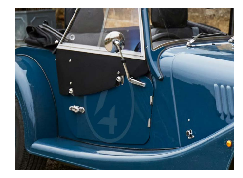
Decal Kit 6 - Door Roundel Matte Clear with Number 0-9