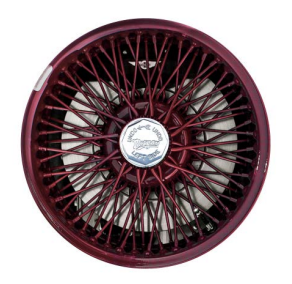
15" Dark Red Painted Wire Wheels