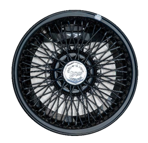
15" Black Painted Wire Wheels