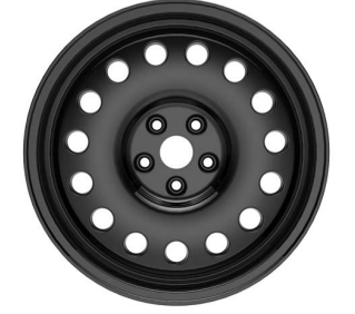
18" Speedster Alloy Wheels - Black