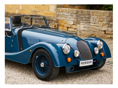
Decal Kit 9 - Bonnet Stripe Matte Black