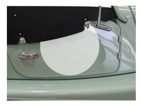
Decal Kit 1 - Door Roundel Gloss, Off White