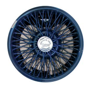
15" Dark Blue Painted Wire Wheels