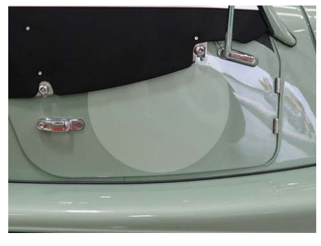
Decal Kit 3 - Door Roundel Matte, Clear