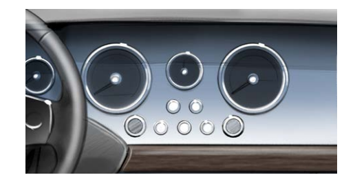
Dashboard - Gloss Body Colour Painted