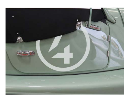
Decal Kit 4 - Door Roundel Gloss Off White with Number 0-9