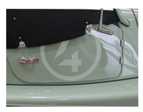
Decal Kit 6 - Door Roundel Matte Clear with Number 0-9