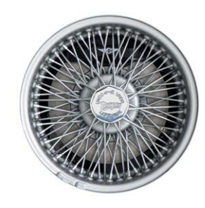
15" Silver Painted Wire Wheels