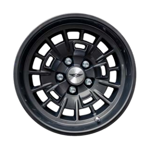
15" Black Alloy Wheels