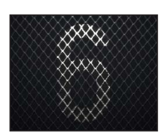
Polished Stone Guard