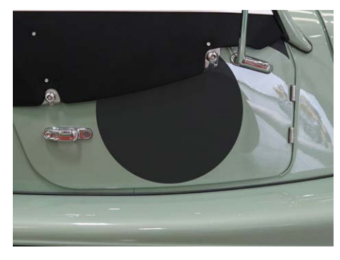
Decal Kit 2 - Door Roundel Gloss, Black