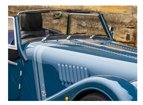
Decal Kit 7 - Matte Stripe Pack