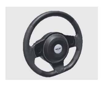
Steering Wheel Centre - Black