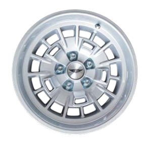
15" Silver Alloy Wheels