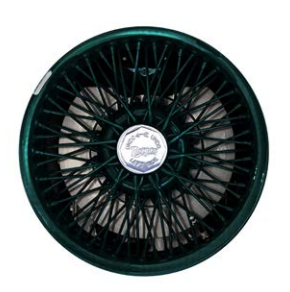
15" Dark Green Painted Wire Wheels