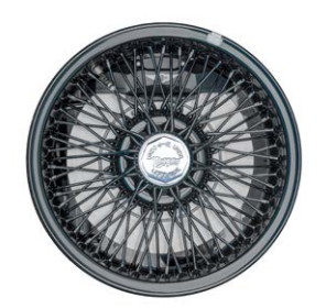
15" Dark Grey Painted Wire Wheels