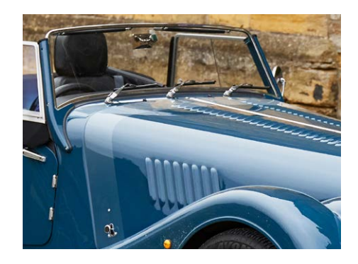
Decal Kit 10 - Bonnet Stripe Matte Clear