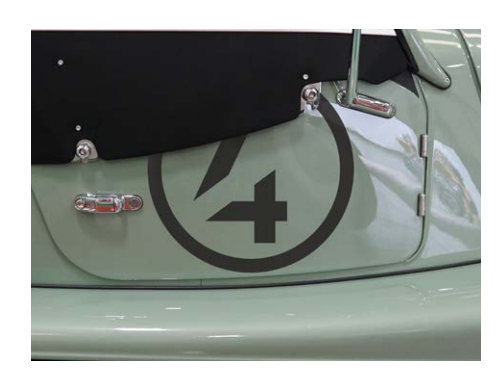
Decal Kit 5 - Door Roundel Matte Black with Number 0-9