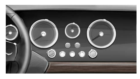
Dashboard - Matte Black Painted