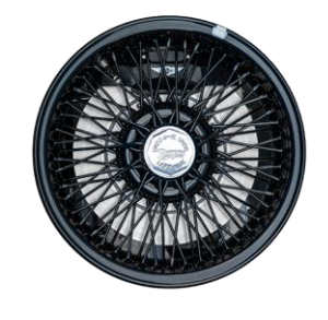
15" Black Painted Wire Wheels