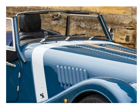
Decal Kit 8 - Bonnet Stripe Gloss Off White