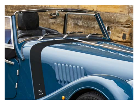
Decal Kit 9 - Bonnet Stripe Matte Black